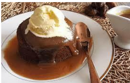
Awa' tae Scotlund