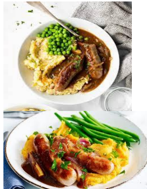
Bangers and Mash